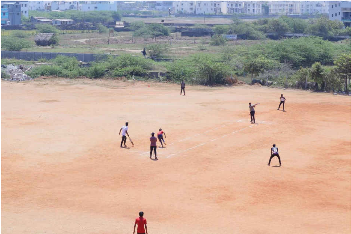
CRICKET MATCH PHOTO