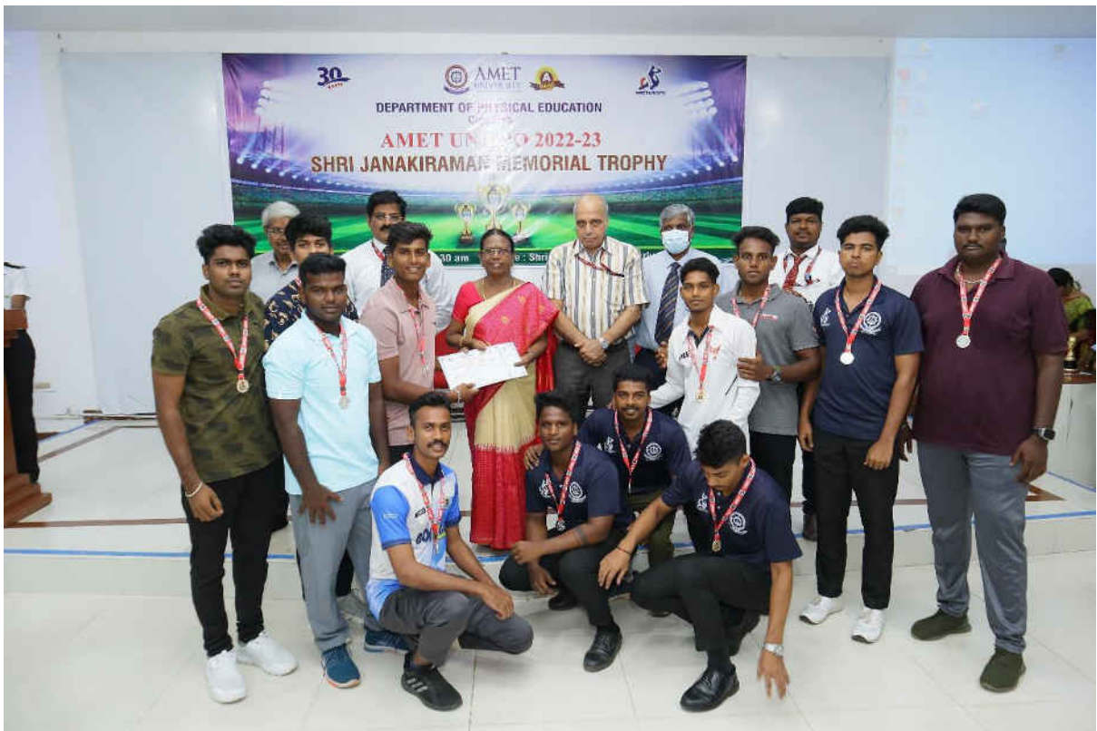
CRICKET RUNNER UP